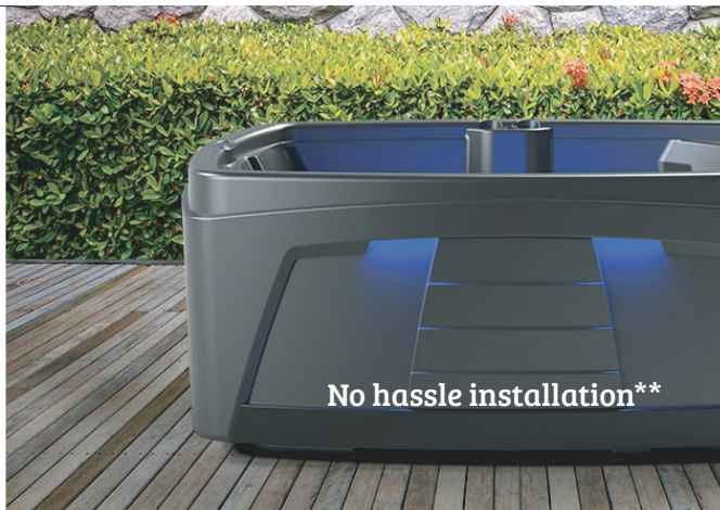
No hassle installation**