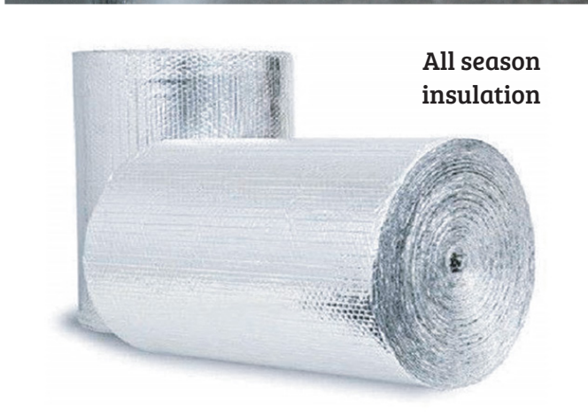
All season insulation