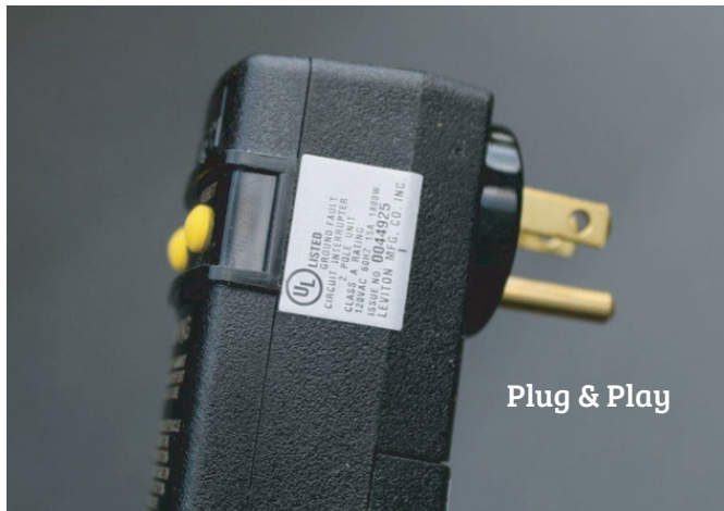
Plug & Play