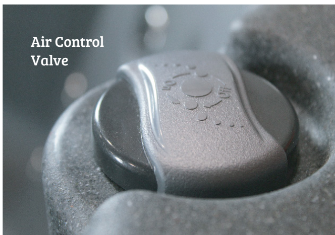
Air Control Valve